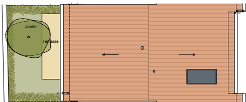
Plan des jardins