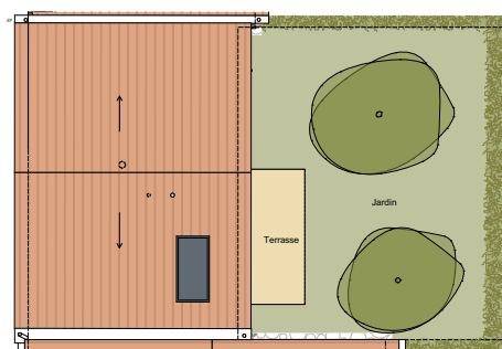
Plan des jardins